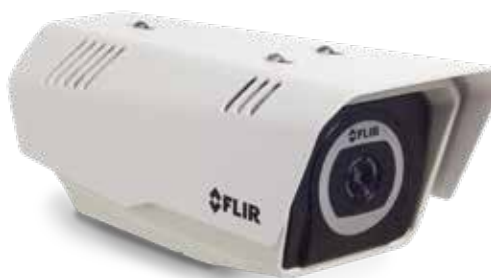
FLIR FC-Series R